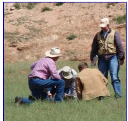
Right: Participants of the Range 301 School work together to identify grasses and range condition.