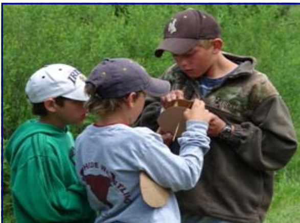
Left: Youth at Black Hills Natural Resource Youth Camp construct water wheels.